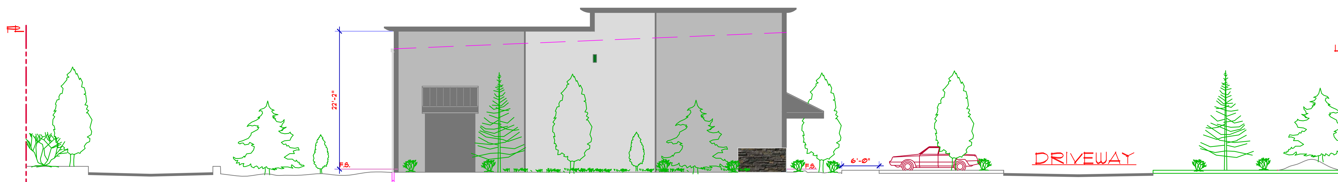
EAST ELEVATION SCALE: 1/8"=1'-0"