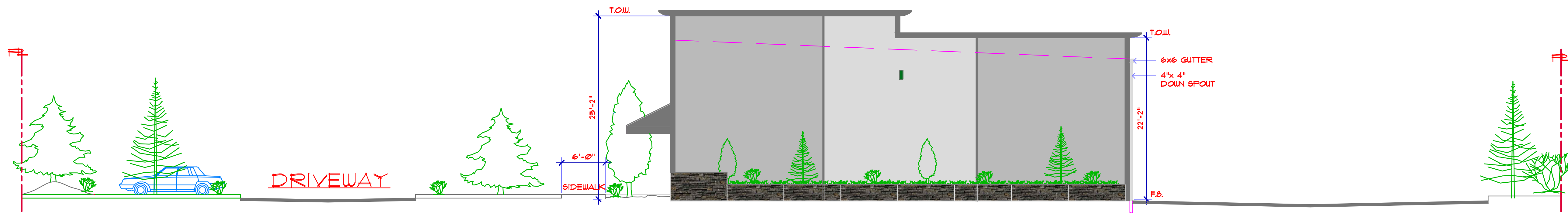
WEST ELEVATION SCALE: 1/8"=1'-0"