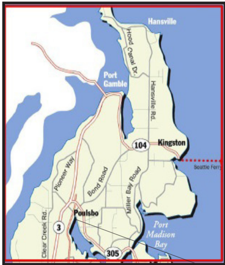
Poulsbo Vicinity Map