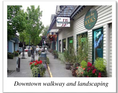
Downtown walkway and landscaping

Implement the Downtown Parking Management Strategy, which identifies short and long-term strategies and alternatives for providing additional Downtown public parking.