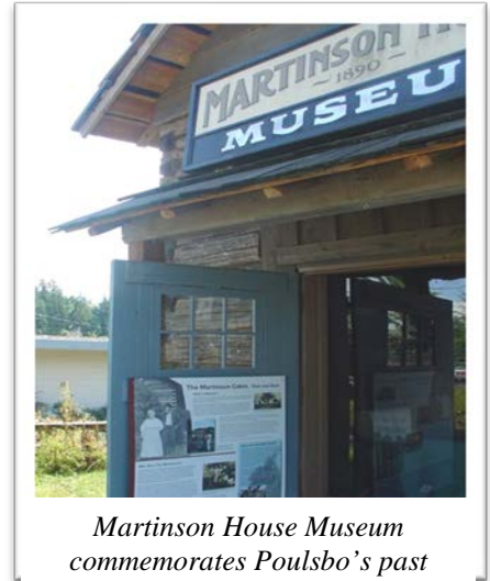
Martinson House Museum commemorates Poulsbo's past

Provide assistance to developers, landowners, and interested citizens in obtaining grants and tax incentives for the reuse and rehabilitation of designated historic sites and buildings.