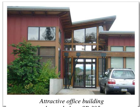
Attractive office building located along SR 305

Design standards for commercially zoned areas shall be developed to continue the northwestern architectural style of the existing commercial areas, and the Scandinavian small fishing village scale architectural style of downtown Poulsbo. The City should review its building design standards every five years to ensure it remains relevant and reflects the desires of the community.