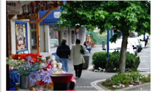
Front Street at Downtown Poulsbo

Downtown Poulsbo is a special hub that draw local residents, tourists, boaters and employers/employees all together. It is an important component of the city's identity. The City is committed to preserving and enhancing the distinctiveness and vitality of Downtown Poulsbo.