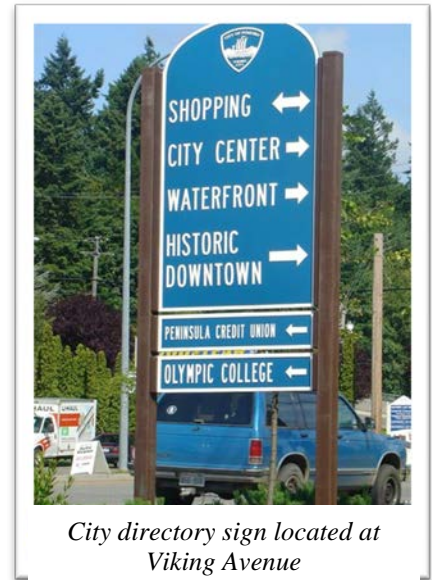
City directory sign located at Viking Avenue