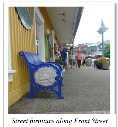
Street furniture along Front Street