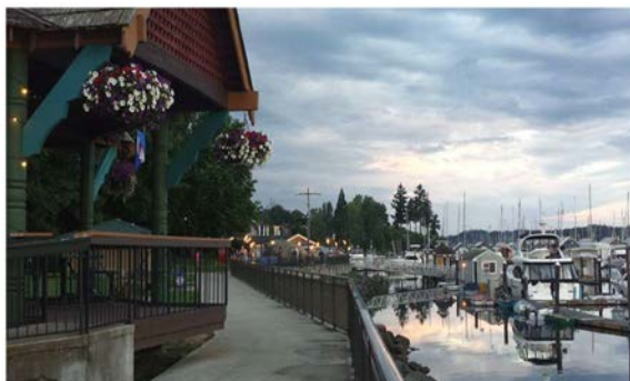
Poulsbo Boardwalk along Downtown shoreline

Encourage preservation of character and enhancement of distinctive focal points within Downtown Poulsbo, including the Muriel Iverson Williams Waterfront Park, boardwalk and piers, Sons of Norway building, storefront designs and pedestrian scale of Front Street.