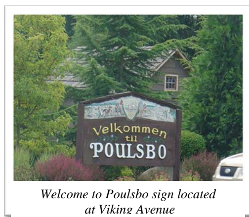
Welcome to Poulsbo sign located at Viking Avenue

Provide residents and visitors with positive identifiable images of Poulsbo.