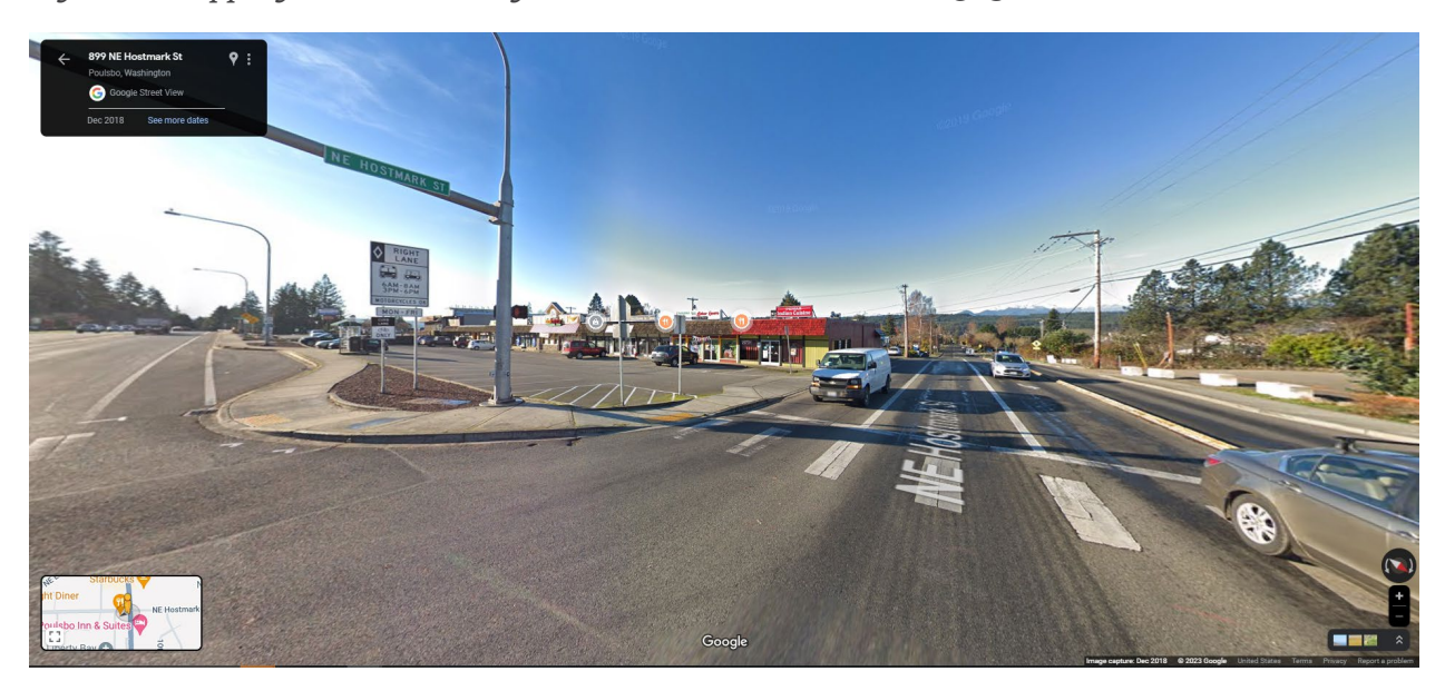
Figure 1. Shopping center driveway on NE Hostmark Street at SR 305

NE Hostmark Street was identified as a corridor facing challenges within the City. NE Hostmark Street currently has a hardened centerline from downtown to SR 305. This is a concern at the shopping center driveway, located on NE Hostmark Street, just west of SR 305. Vehicles exiting the parking lot sometimes make unsafe U-turns at the intersection or drive the wrong way down that side of the street until they reach a break in a barrier. This driveway is pictured in Figure 1 and Figure 2 .