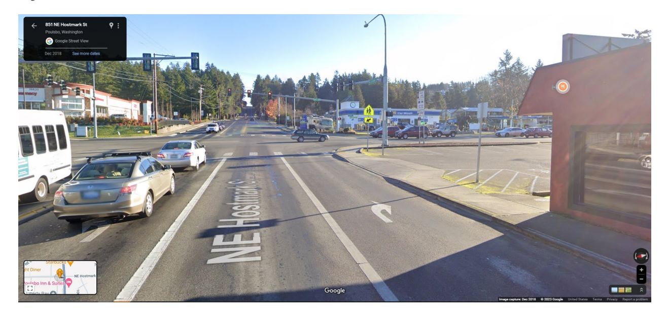
Figure 2. NE Hostmark Street at SR-305

Poulsbo Complete Streets Stakeholder Meeting #2 11/30/2023 Page 5 of 9