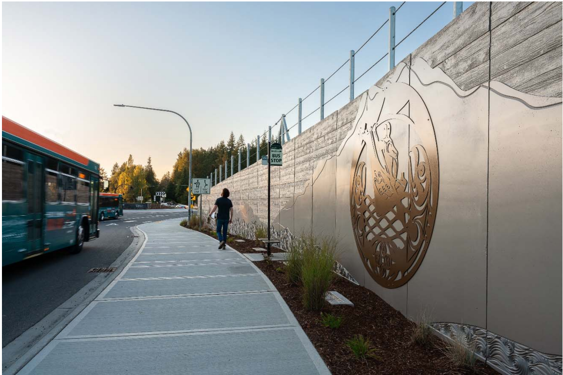
Completed Johnson Parkway with Retaining Wall and Artwork