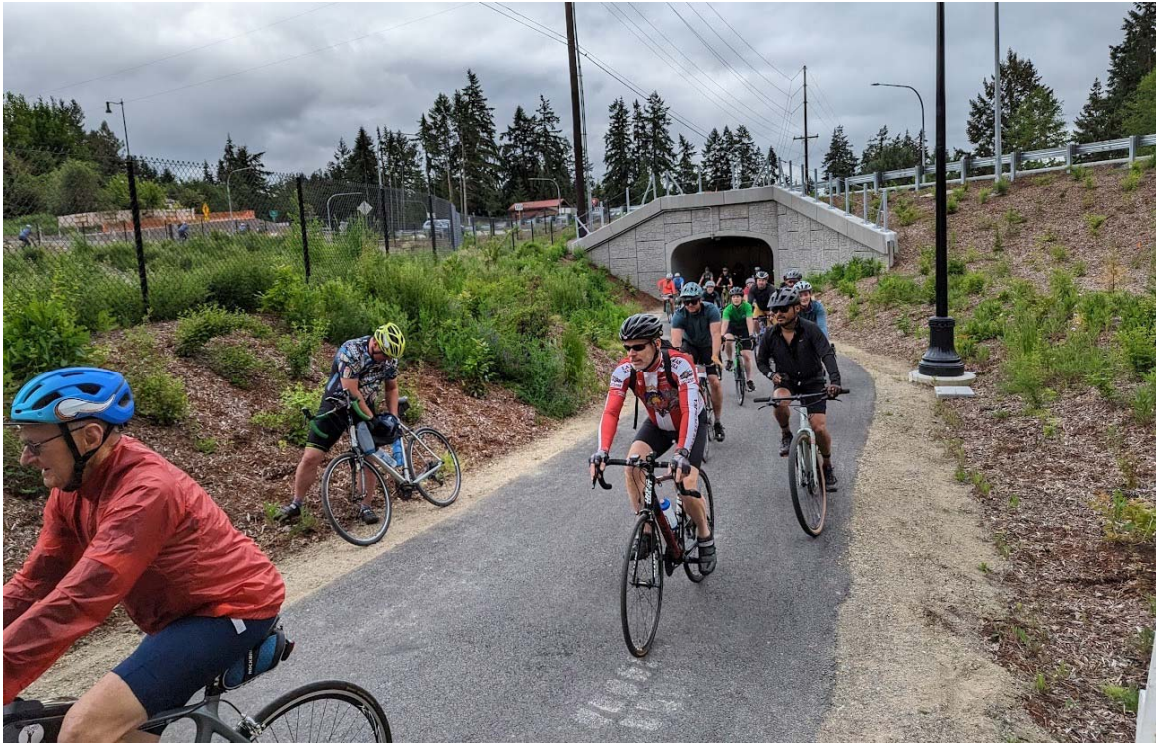
Johnson Parkway Non-Motorized Tunnel