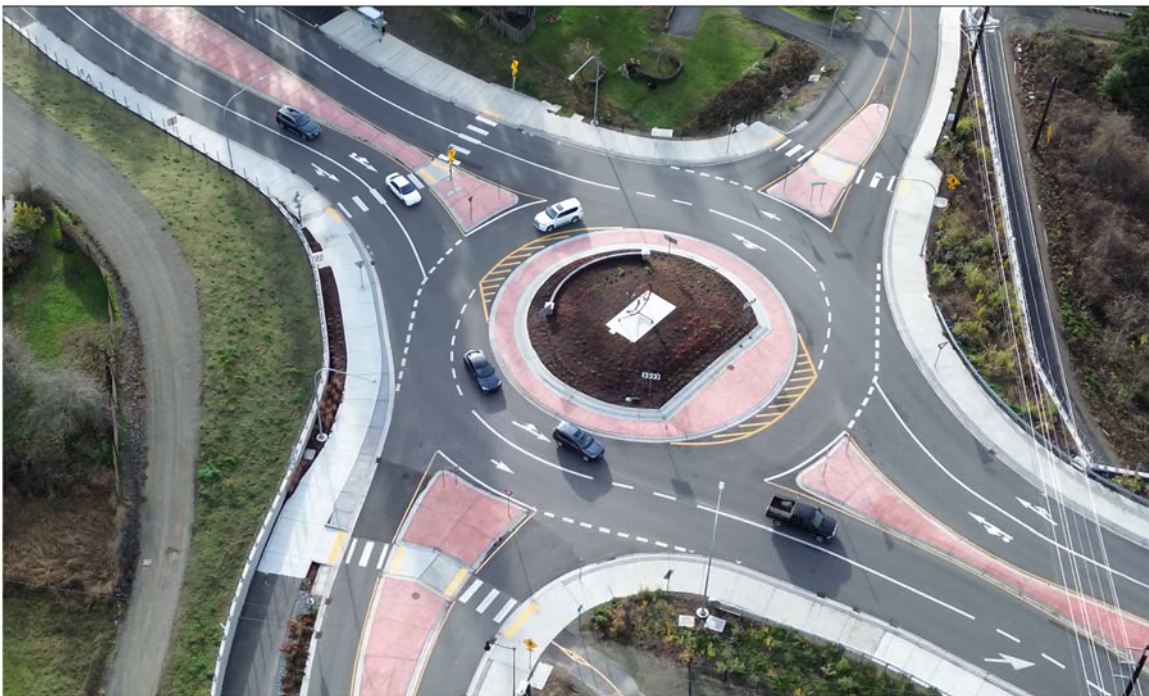
Completed Roundabout at SR 305 & Johnson Road