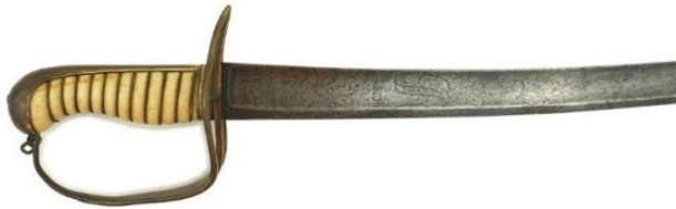
British Military Saber