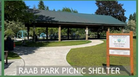
RAAB PARK PICNIC SHELTER

The City of Poulsbo has three beautiful parks with facilities available to rent: The Austin-Kvelstad Pavilion at Muriel Iverson Williams Park, and the Raab Park and Nelson Park Picnic Shelters.