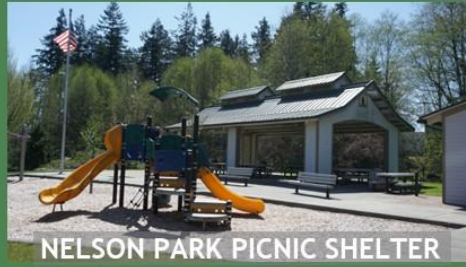
NELSON PARK PICNIC SHELTER