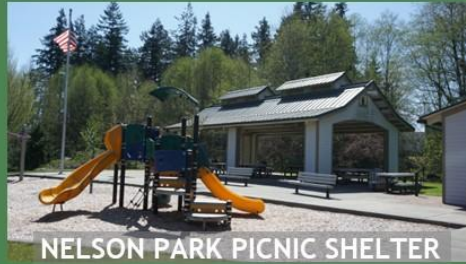
NELSON PARK PICNIC SHELTER