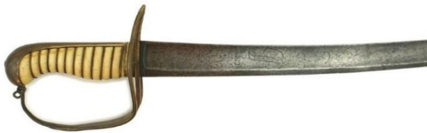
British Military Saber