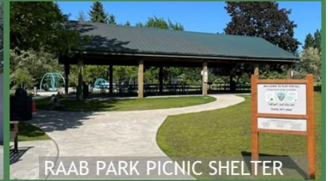
RAAB PARK PICNIC SHELTER

The City of Poulsbo has three beautiful parks with facilities available to rent: The Austin-Kvelstad Pavilion at Muriel Iverson Williams Park, and the Raab Park and Nelson Park Picnic Shelters.